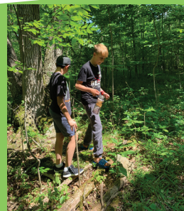
Chippewa Bay Preserve and Nature Trail

TILT has many Preserves and trails that are open year-round to the public. Visit our website, find the perfect trail for you, and GET OUTSIDE!