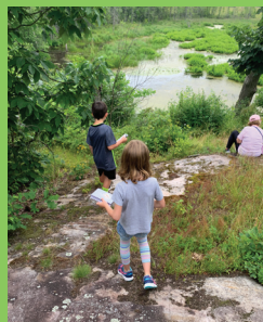
Otter Creek Preserve and Nature Trail