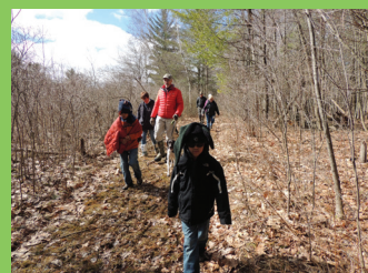
MacSherry Trail at Crooked Creek Preserve