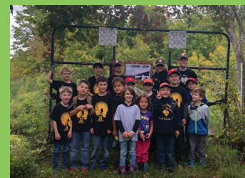
Sissy Danforth Rivergate Trail at S. Gerald Ingerson Preserve

THANK YOU to our 2019 TILTKids Day Camp & KidsTreks Sponsors!