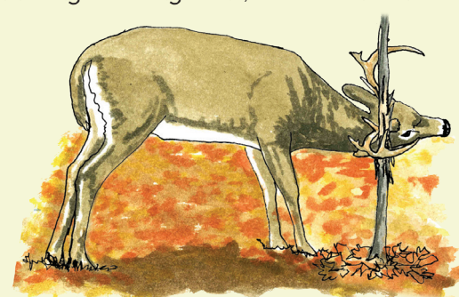
All Illustrations by Robert McNamara of The Art of Wilderness

Have you ever been surprised on the edge of a thicket by a bird taking off right under your feet? There are several possible culprits, but it could be a Ruffed Grouse. These birds nest in shrubby areas and generally spend most of their time on the ground, rather than in trees. The Ruffed Grouse is a chicken-like, mottled brown bird. During mating season (end of March to mid-June, with the peak being early April) Ruffed Grouse males beat one of their wings on a log, producing an accelerating drumming sound, to attract females.