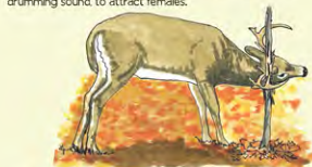
All Illustrations by Robert McNamara of The Art of Wilderness

Have you ever been surprised on the edge of a thicket by a bird taking off right under your feet? There are several possible culprits, but it could be a Ruffed Grouse. These birds nest in shrubby areas and generally spend most of their time on the ground, rather than in trees. The Ruffed Grouse is a chicken-like mottled brown bird. During mating season (end of March to mid-June, with the peak being early April) Ruffed Grouse males beat one of their wings on a log, producing an accelerating drumming sound, to attract females.